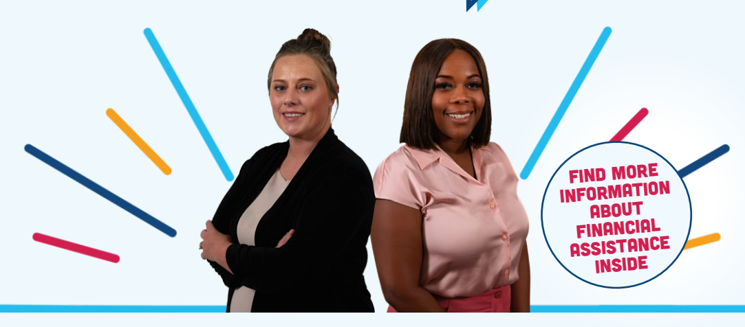
OneSource Team Members

YOUR CHILD'S CONDITION MAY BE RARE, BUT IT'S NOT RARE TO US.