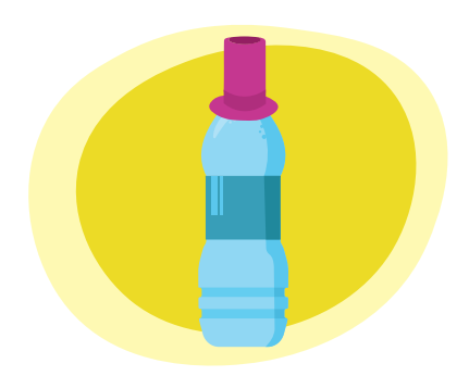
PILL SWALLOWING CAP