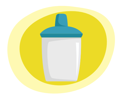
PILL SWALLOWING CUP

You can also ask your doctor or local pharmacist if there are other tools or tips that may help your child take their Koselugo dose.